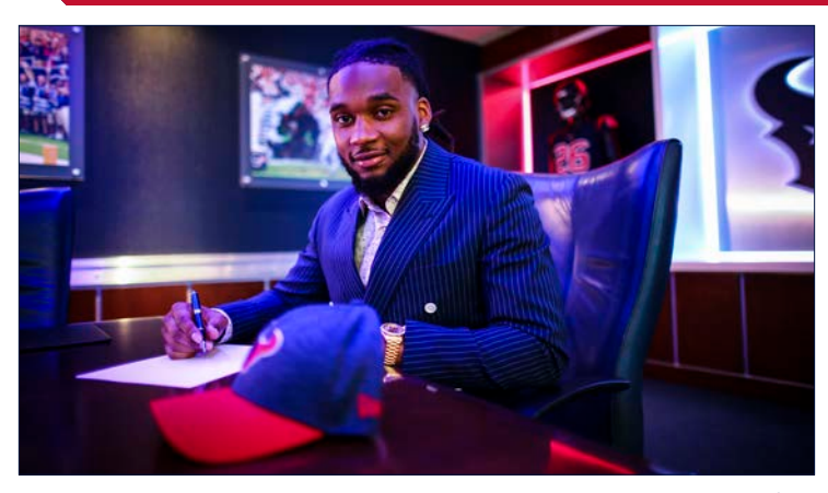
The Texans re-signed CB Bradley Roby on March 21, 2020 after amassing 38 total tackles (35 solo), two tackles for loss, 1.0 sack, one quarterback hit, two interceptions (one returned for a touchdown), eight passes defensed and one forced fumble in his debut season for the Texans. Roby also started both postseason contests and notched his second career postseaon game with multiple passes defensed in the Wild Card Round win over Buffalo (1/4/20).